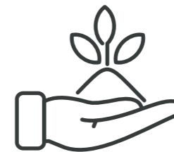
Prime for Life